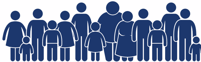
support in the community