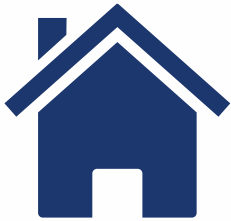
care at home